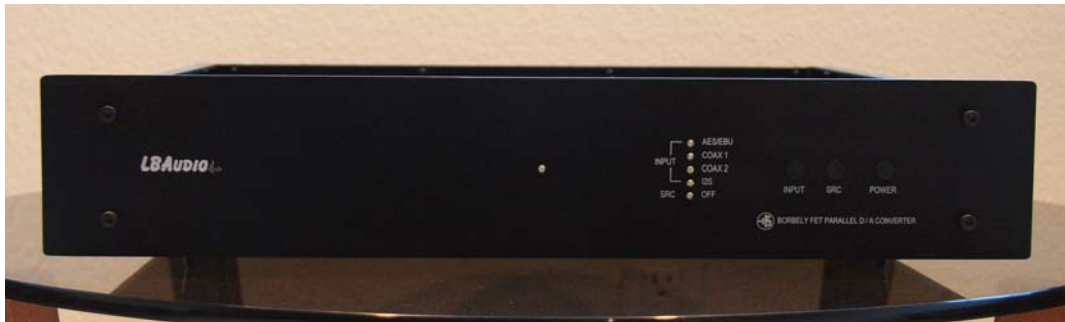
FET 435-259 Parallel DAC Front Panel