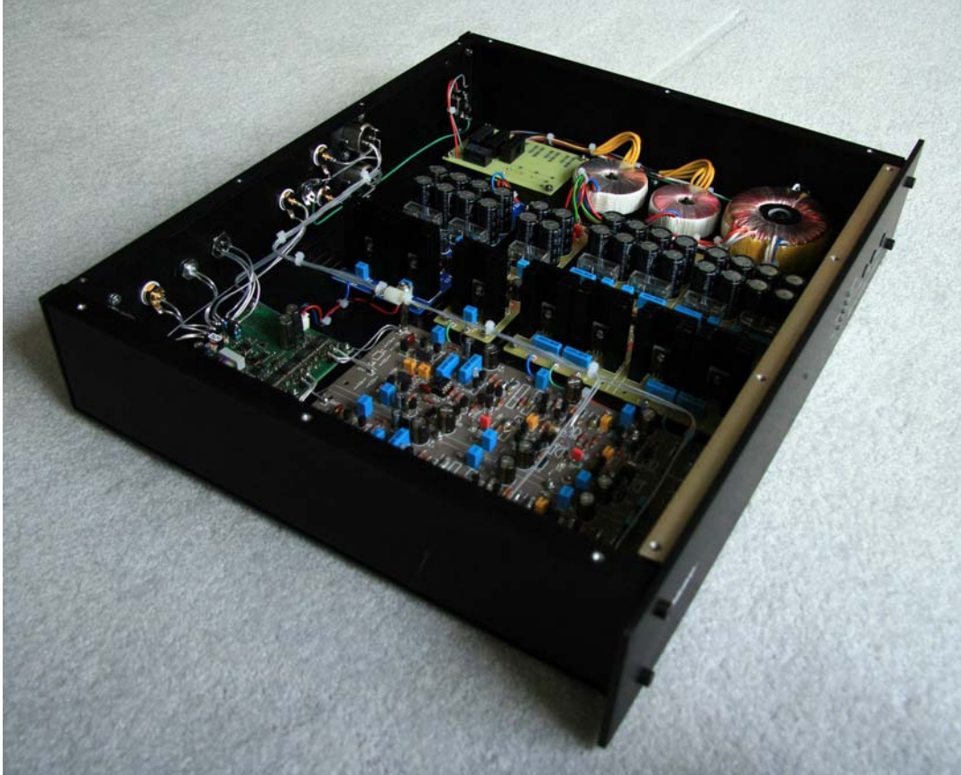
FET 435-259 Parallel DAC Interior