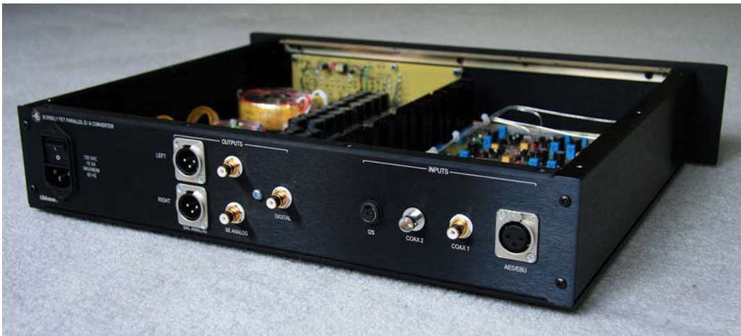
FET 435-259 Parallel DAC Rear