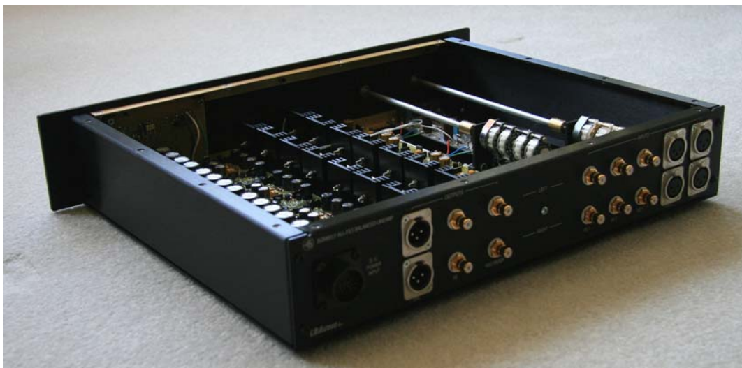
Balanced All-FET 325-259 Line Amp Rear