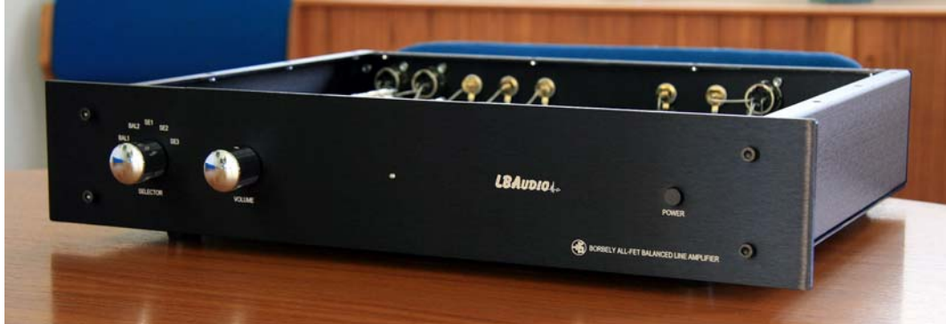
Balanced All-FET 325-259 Line Amp Front