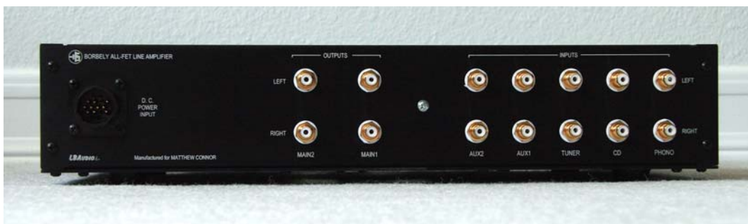
All-FET 325-259 Line Amp Rear