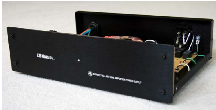
All-FET 325-259 Power Supply