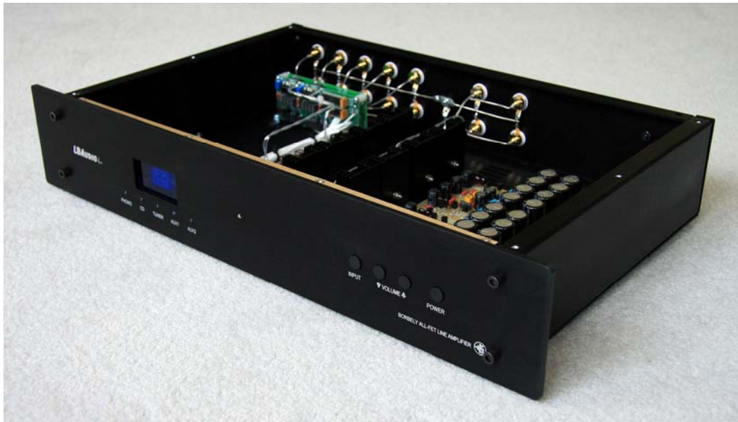
All-FET 325-259 Line Amp Front