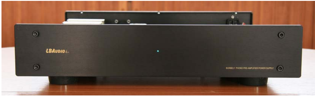
All-FET 320-254 Power Supply Front