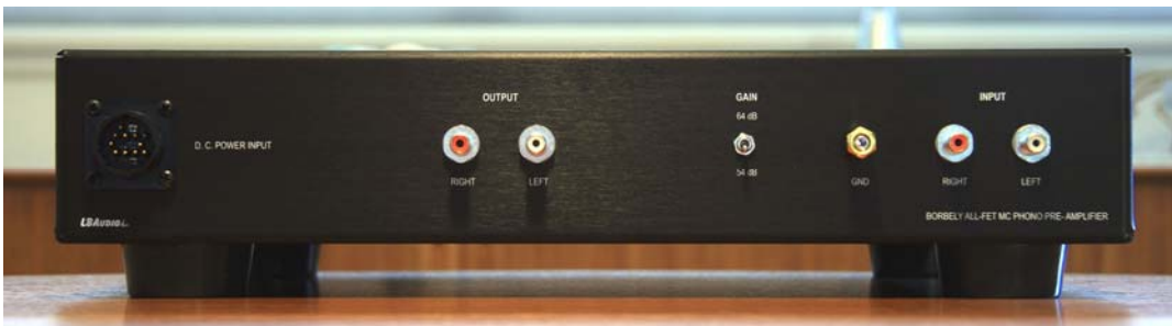
All-FET 320-254 Phono Preamplifier Rear