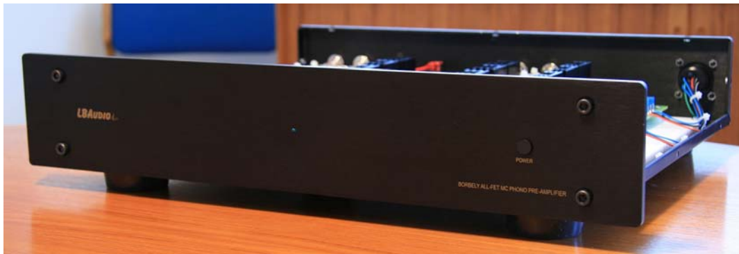
All-FET 320-254 Phono Preamplifier Front