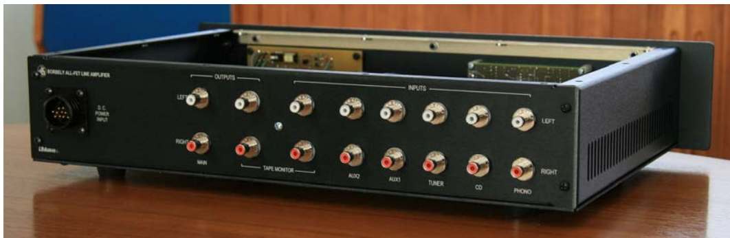
All-FET 309-254 Line Amp Rear