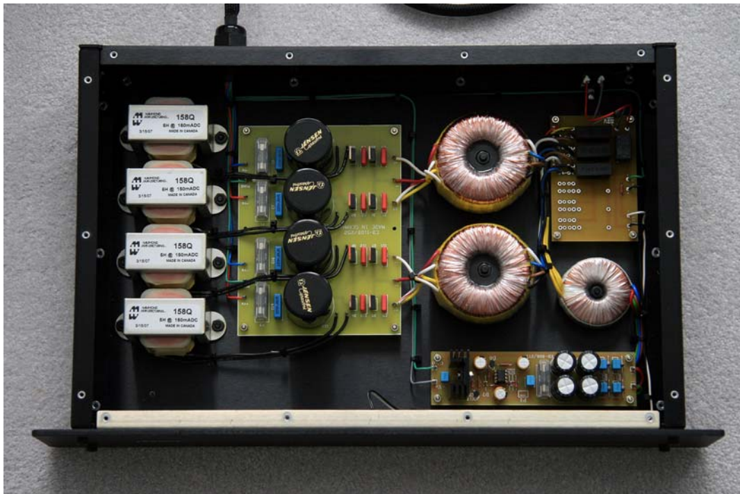
All-FET 309-254 Power Supply Interior