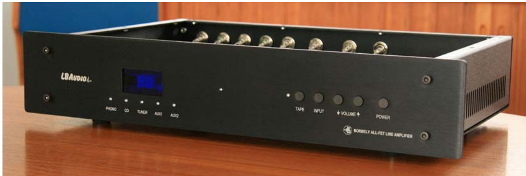
All-FET 309-254 Line Amp Front