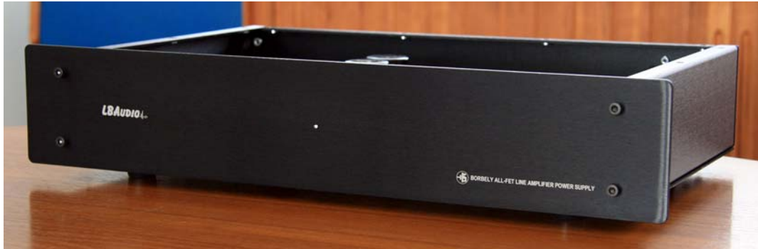
All-FET 309-254 Power Supply