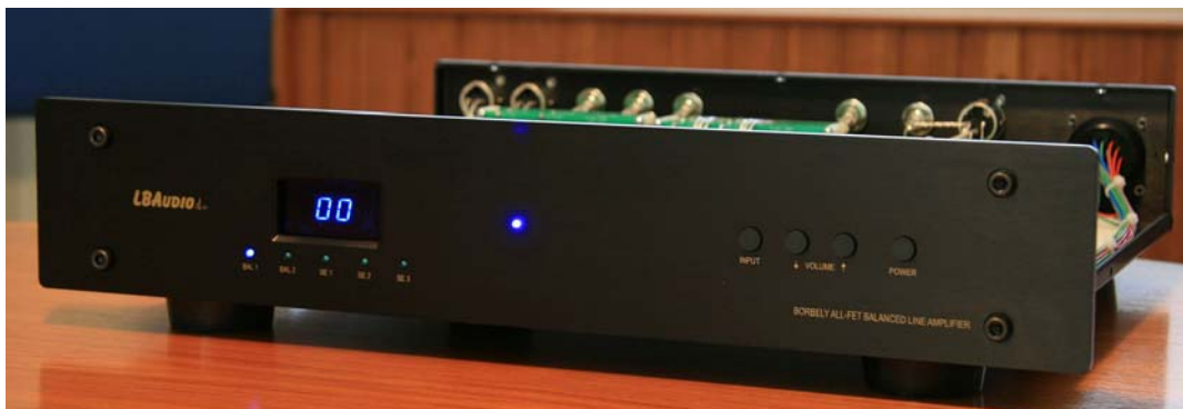
Balanced All-FET 309-254 Line Amp Front