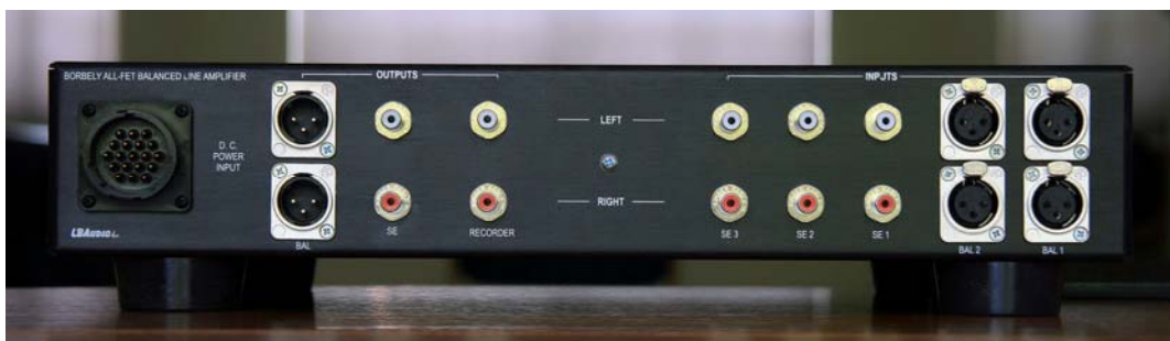
Balanced All-FET 309-254 Line Amp Rear