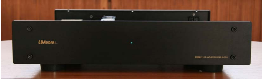
Balanced All-FET 309-254 Power Supply Front